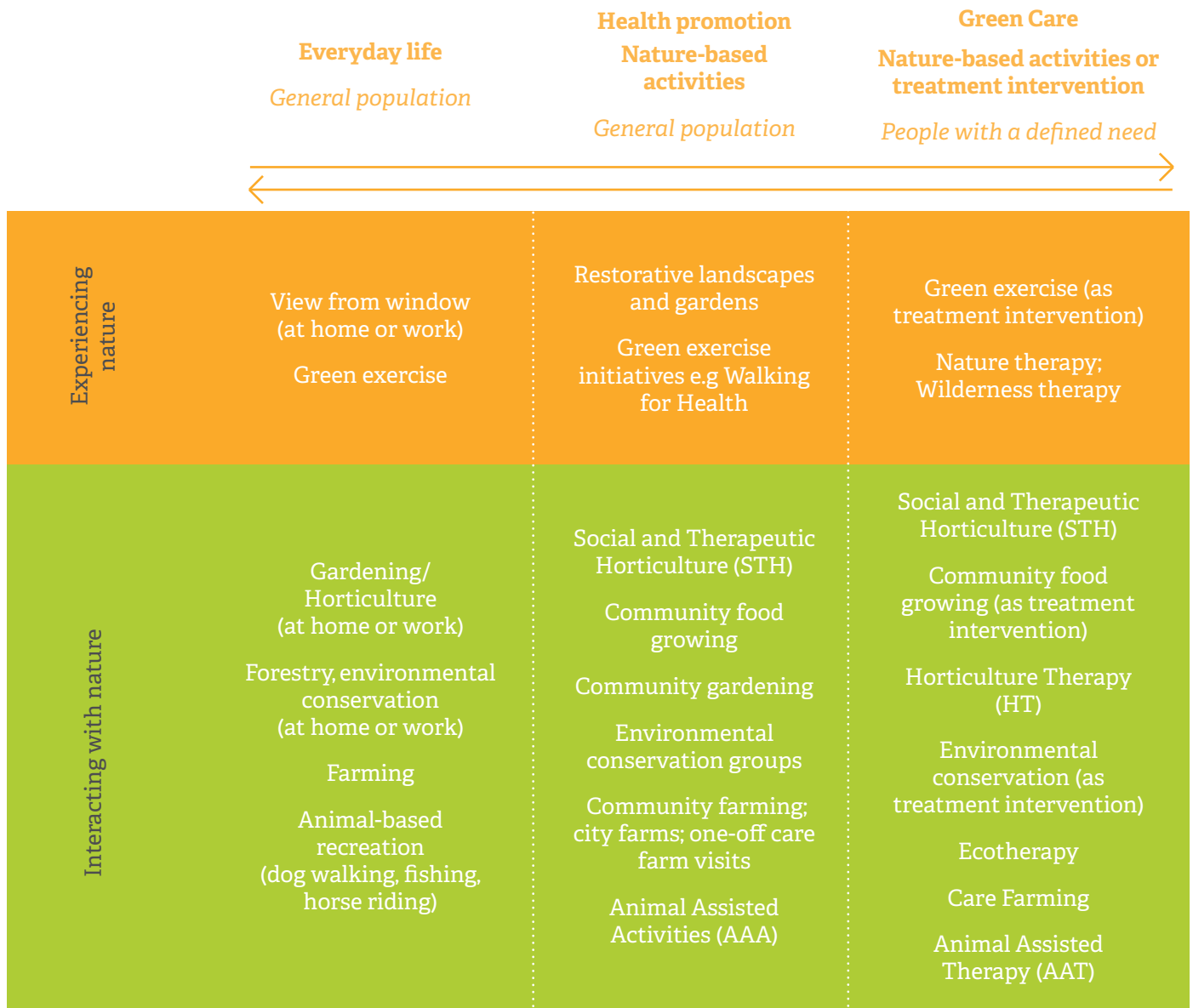
Figure 1. The different contexts in which an individual may engage with nature

Explanatory notes: The 3 columns represent the different contexts in which an individual may engage with nature. On the left, the 'Everyday life' column highlights various situations in which an individual engages with nature as part of their normal lifestyle, including everyday leisure or work activities. People usually make a conscious choice to incorporate these nature-based activities into their lifestyle and have the ability and opportunity to do so.